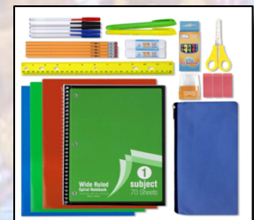
Full School Supply Kit

Similar books for all levels: K-3, 4-6, 7-8